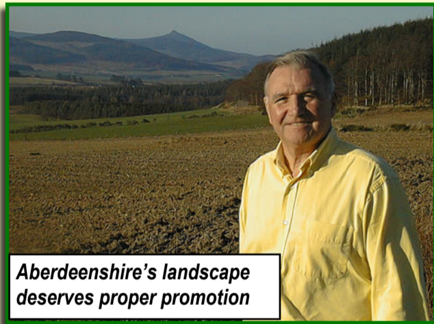
Aberdeenshire's landscape deserves proper promotion

Malcolm is calling for a new tourism strategy for the country and has been in touch with Visit Scotland putting pressure to save the Inverurie Tourist Information Centre. However, he believes that there should be a bigger vision for tourism in the North East.