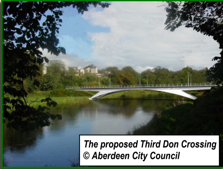
The proposed Third Don Crossing

With the Aberdeen Western Peripheral Route facing further delays and with slow progress on the campaign for a Third Don Crossing, Malcolm is determined to keep the pressure on to make sure that these essential improvements are delivered.